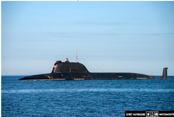
Russian Project 885 submarine during sea trials.