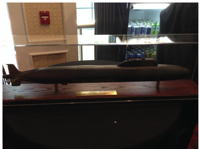
Model of Russian submarine Severodvinsk built for NAVSEA.

Severodvinsk is the most capable Russian attack submarine ever built and leverages many of the technologies the Soviet Union invested in during the 1970s and 1980s.